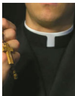
Sun - Priesthood Sunday