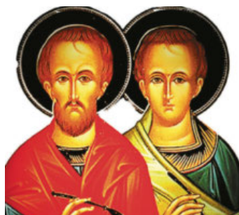
Sept. 26 - Sts. Cosmas and Damian, Martyrs