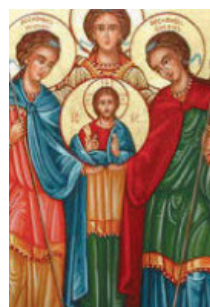
Sept 29 - Ss. Michael, Gabriel, and Raphael