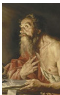
Sept 30 - St. Jerome