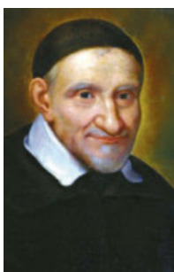
Sept. 27 St. Vincent de Paul