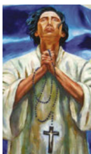
Sept 28 - St. Lawrence Ruiz and Companions; St. Wenceslaus