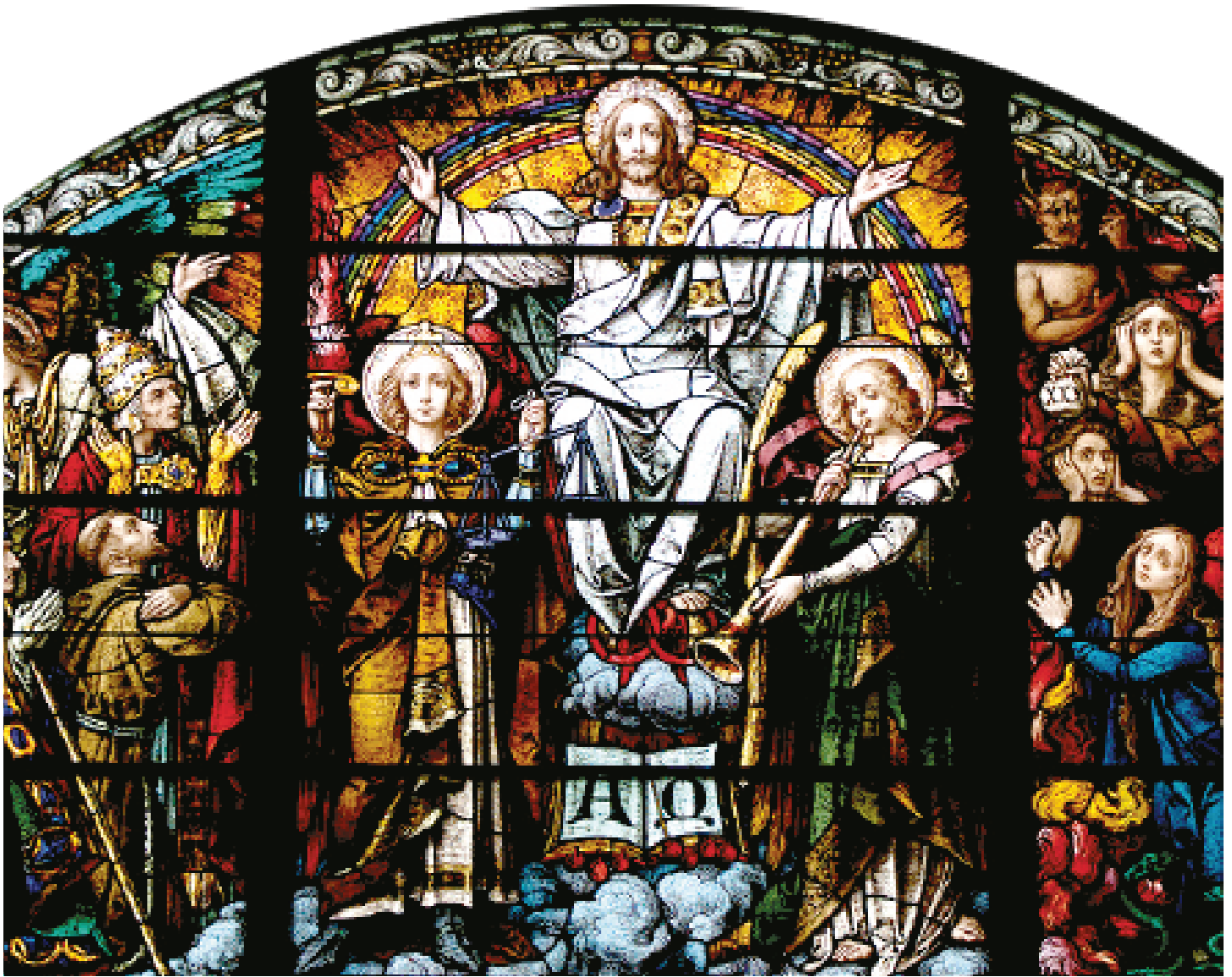
Photo: Stained Glass Window in our church.

THE SOLEMNITY OF OUR LORD JESUS CHRIST, THE KING OF THE UNIVERSE NOVEMBER 26, 2023