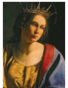
Nov. 25 - St. Catherine of Alexandria