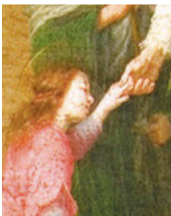
Nov. 21 - The Presentation of the Blessed Vigin Mary