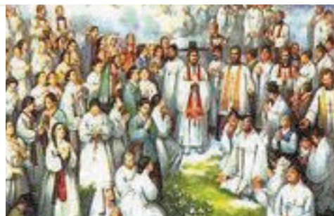
Nov. 24 - St. Andrew Dũng-Lạc and Companions