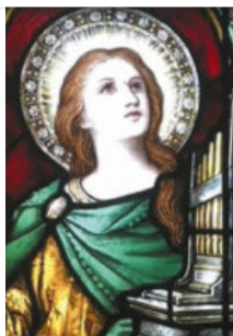
Nov. 22 - St. Cecilia