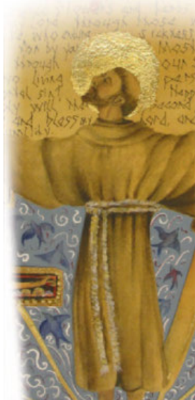
While this prayer has always been attributed to St. Francis, the author is actually unknown. The prayer does wonderfully represent the spirit of St. Francis and the Franciscan Orders.

Lord, make me an instrument of your peace ; where there is hatred, let me sow love ; where there is injury, pardon ; where there is doubt, faith ; where there is despair, hope ; where there is darkness, light ; and where there is sadness, joy .