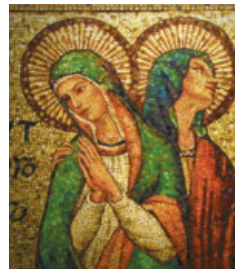
March 7 - Sts. Perpetua and Felicity