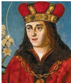
March 04 - St. Casimir