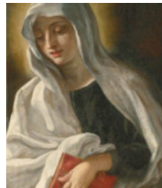
March 09 - St. Frances of Rome; Abstinence from meat