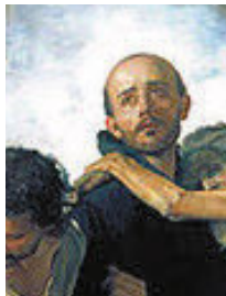
March 08 - St. John of God