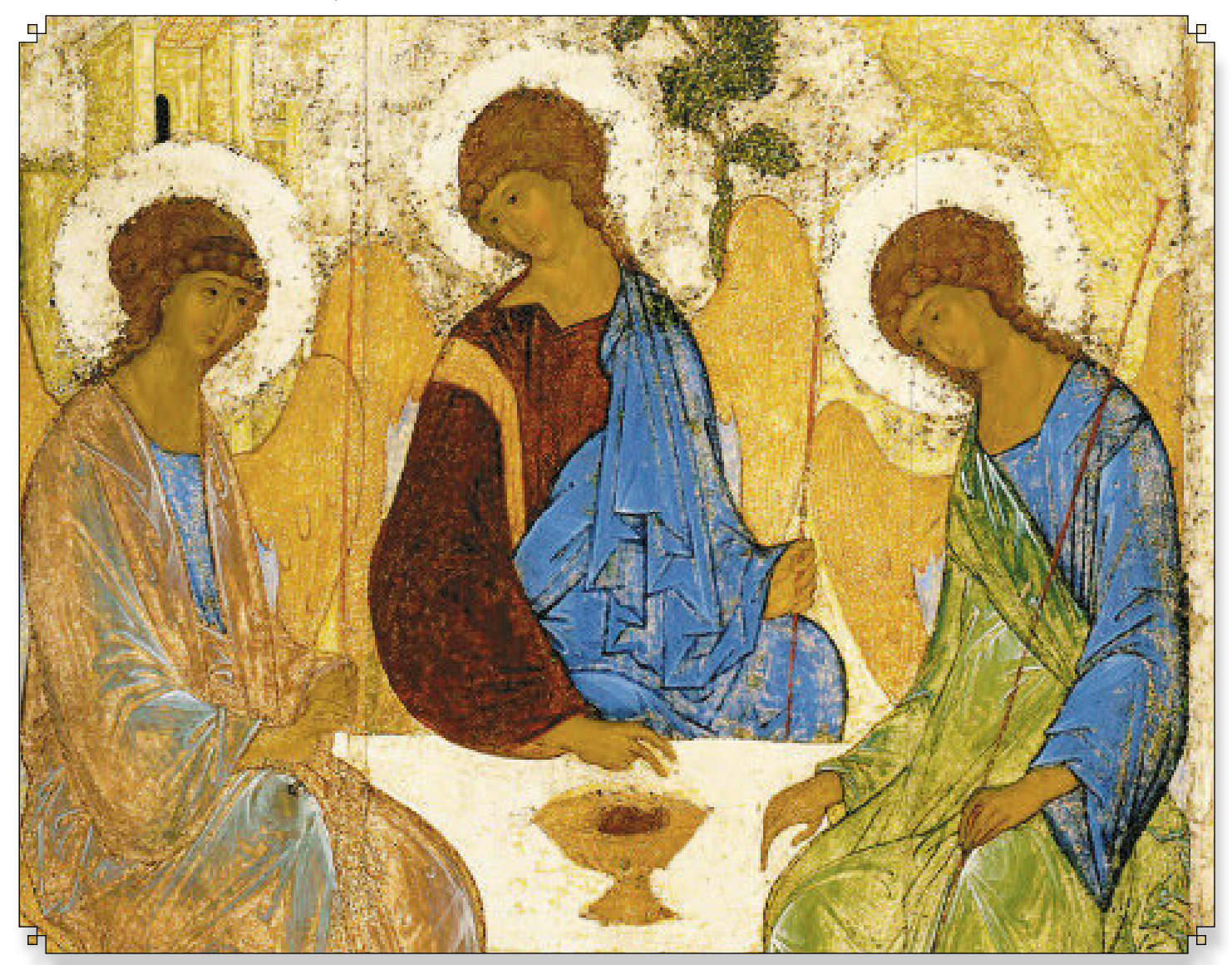
Icon of the Holy Trinity by Andrei Rublev, circa 1400, tempera on wood. Public Domain.