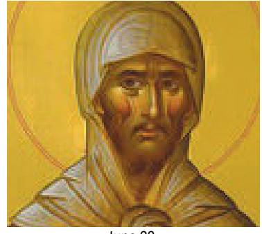
June 09 -St. Ephrem, Deacon and Doctor of the Church

stfrancisparish.com • facebook.com/SFAPSacramento • YouTube: https://bit.ly/37XEfK3