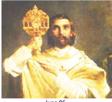
June 06 -St. Norbert, Bishop