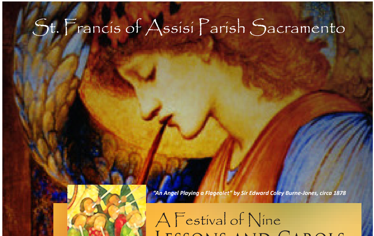
"An Angel Playing a Flageolet" by Sir Edward Coley Burne-Jones, circa 1878