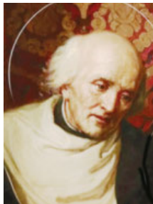
Dec. 21 - St. Peter Canisius; Winter Begins