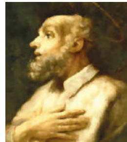
Dec. 23 - St John of Lanty