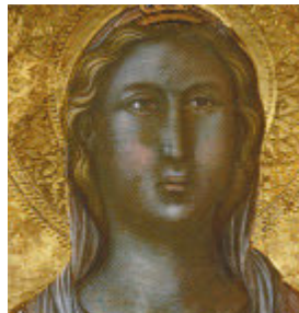
Dec 13 - St. Lucy, Virgin and Martyr