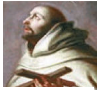
Dec. 14 - St. John of the Cross

stfrancispark.com • facebook.com/SFAPSacramento • YouTube: https://bit.ly/37XEfK3