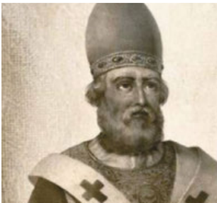
Dec 11 - St. Damasus I