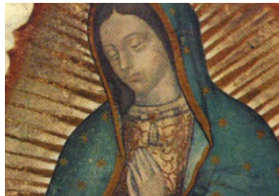
Dec 12 - Our Lady of Guadalupe