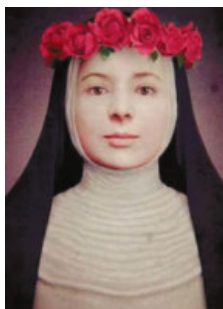
Aug 23- St. Rose of Lima