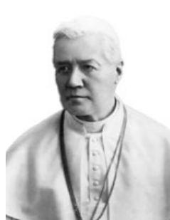
Aug 21 - St. Pius X