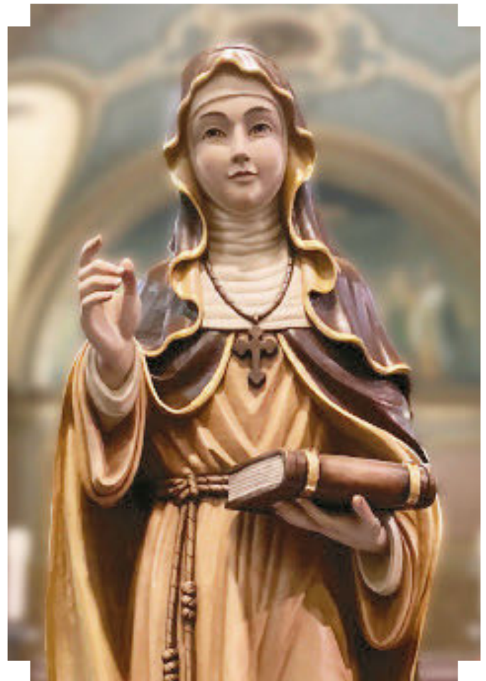
Our new St. Clare statue, in the church.

On August 11, 1253, Sister Death made her appearance. Clare died in the Assisi monastery where she had spent over forty years, surrounded by her Sisters and two of Francis' very first companions, Angelo and Leo. Two of her Sisters heard Clare speaking before she died. When asked to whom she was speaking, she responded, "I am speaking to my soul: Go without anxiety for you have a good escort for your journey, Go." Innocent celebrated her funeral, and in only two months time, he directed the Bishop of Spoleto to open the Process of Canonization. Alexander IV (formerly Cardinal Raynaldus) presided at the ceremony in 1255.