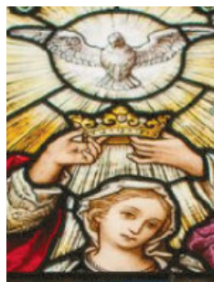
Aug 22- The Queenship of the Blessed Virgin Mary