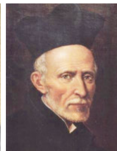
Aug 25 - St. Joseph Calasanz; St. Louis