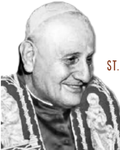
ST. JOHN XXIII