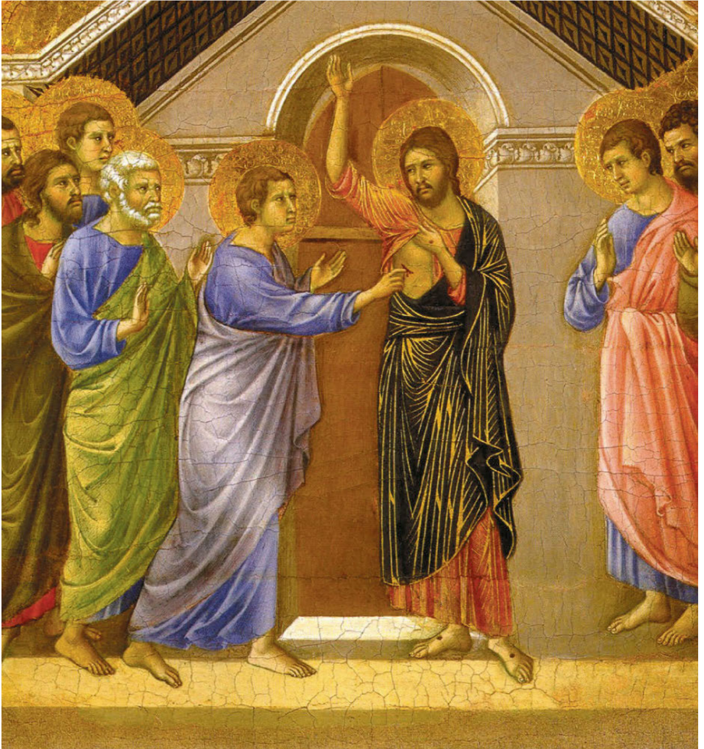
From The Maestà of Duccio by Duccio di Buoninsegna. Circa 1308

APRIL 16, 2023 - SECOND SUNDAY OF EASTER (SUNDAY OF DIVINE MERCY)